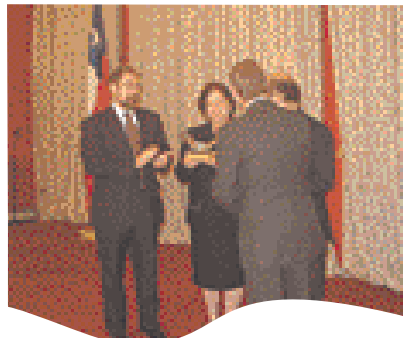
Chile's First Lady Ms. Luisa Duran de Lagos receives the Jerusalem Prize from the Zionist Federation in Santiago.