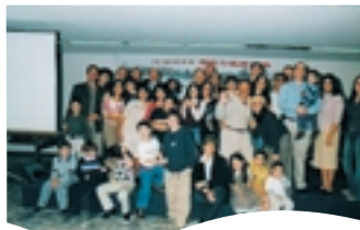
Some of the 100 olim from Venezuela on the eve of their aliyah.