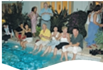
Participants of the ZF's mission to Israel cool their feet after a fun-filled day of touring