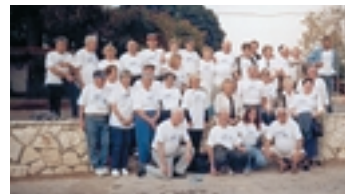
South African Zionist Federation within one year!

to bring a group of Jews and Christians to Israel for an intensive and exciting week of touring and activities to mark the 60th anniversary of the rescue of the Danish Jews.