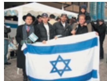
helped the Zionist Federation in organizing the event, which enjoyed wide support from a variety of Jewish and non-Jewish organizations.