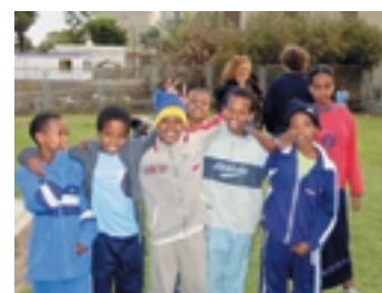
Belgian visitors left 2,000 pounds of clothing that they had collected in Belgium for needy children.

Switzerland (President – Claude Naville): "Jews from Arab Countries – A Story of Mass Violation of Human Rights" was the subject of a lecture organized by the Zionist Federation in Zurich. The lecture covered many issues connected with the expulsion and stripping of property of 900,000 Jews from Arab countries.