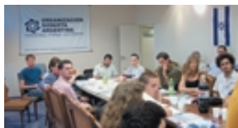
Studying Israel in Argentina